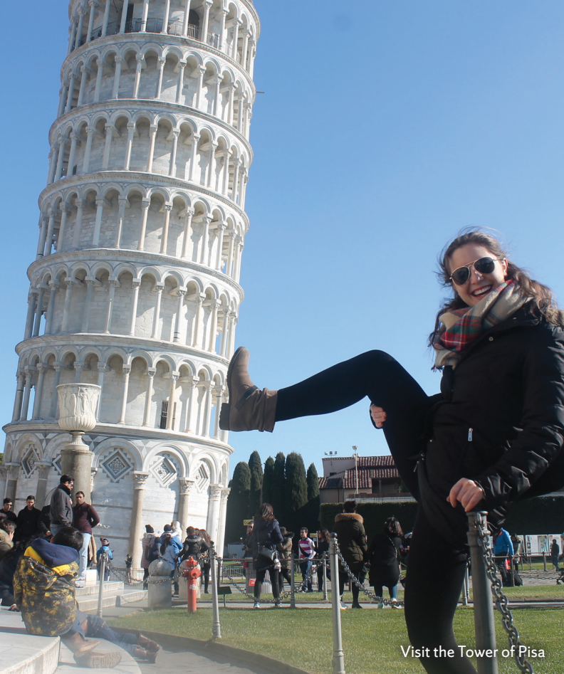
Visit the Tower of Pisa

Ready to expand your horizons in Florence? Visit the Syracuse Abroad website or meet with your academic advisor, and start planning your Italian experience.