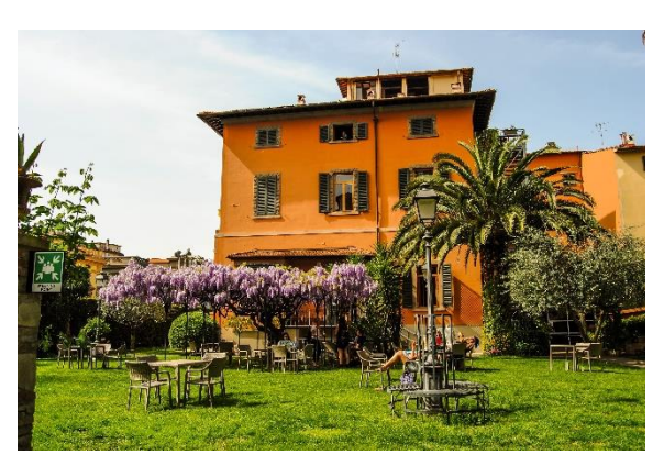
The garden at the Villa Rosa is a popular study spot for students.