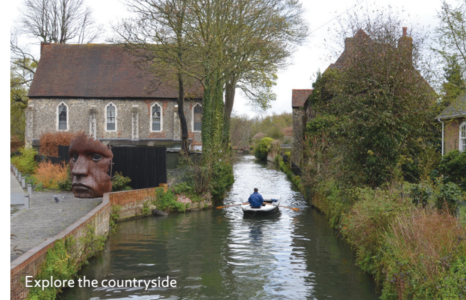
Explore the countryside

The Syracuse London program includes tours of important U.K. destinations, such as the Tower of London , Stonehenge and Westminster Abbey , and also day trips that give you the opportunity to explore other areas in the United Kingdom. The program includes a weekend field trip to another major European city—Paris (France) or Edinburgh (Scotland) for example. And, we’ll connect you with opportunities for civic engagement and volunteering in the local community. These activities give you the chance to form lasting friendships with people from all around the United Kingdom as well as your program mates!