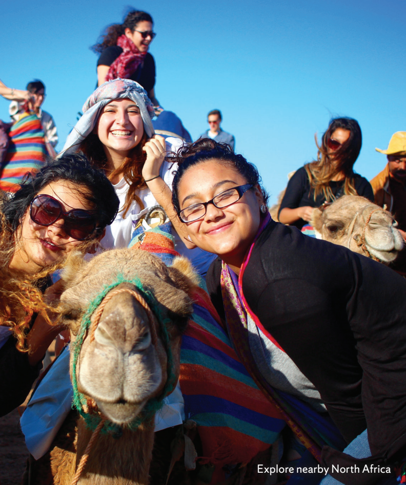
Explore nearby North Africa

Meet us in Madrid! Visit the Syracuse Abroad website and schedule an appointment with your academic advisor to learn how you can explore and learn in Syracuse Madrid.