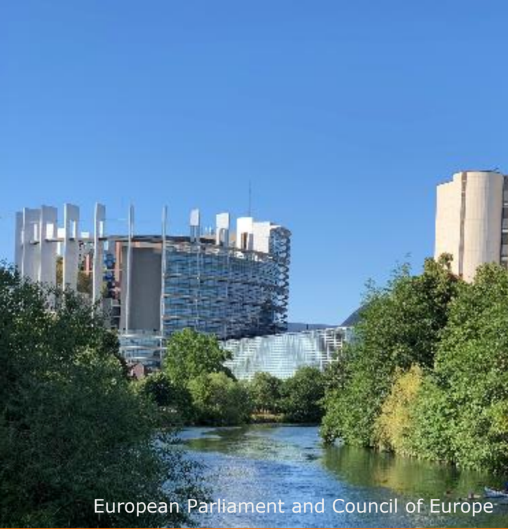
European Parliament and Council of Europe