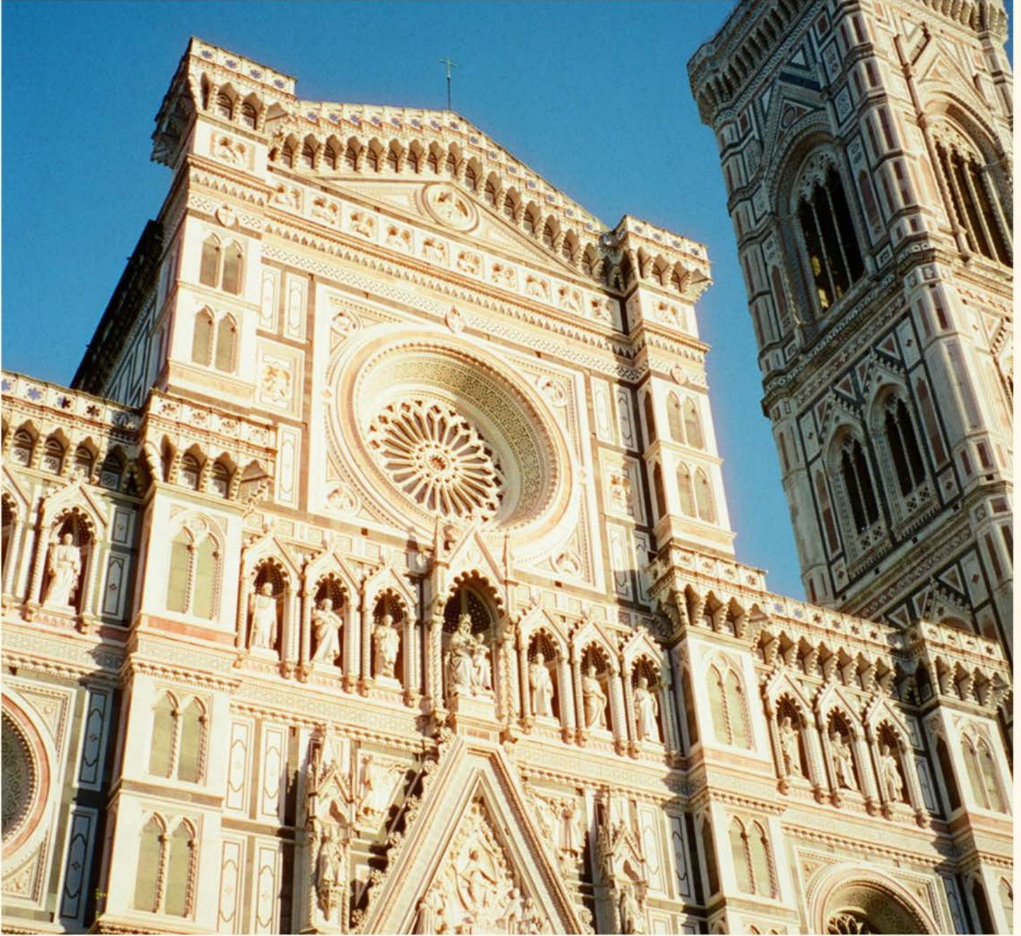
PICTURED: THE DUOMO