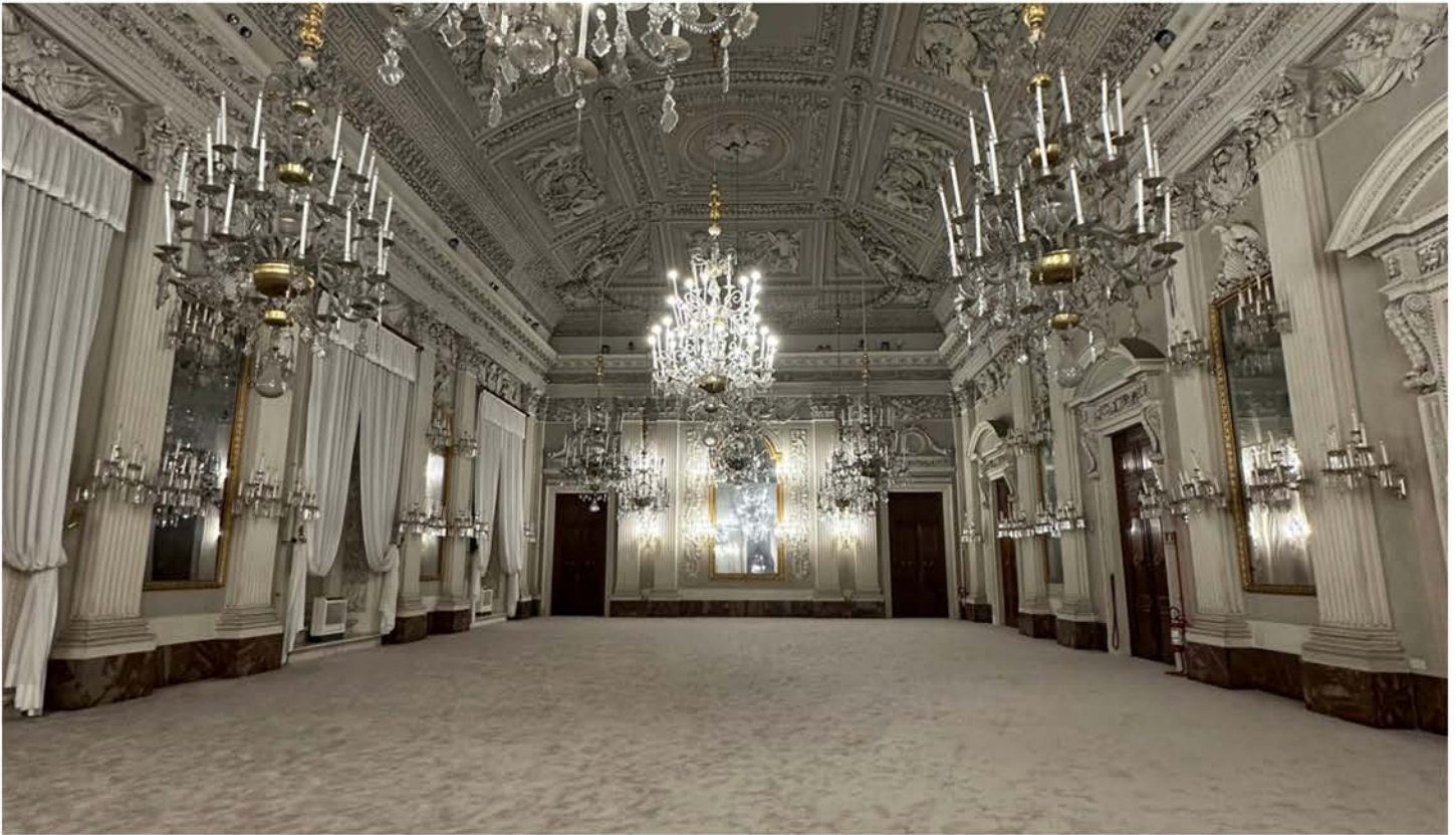
PICTURED: PALAZZO PITTÌ

Of course, there's the obvious spots to visit when going to Florence. This would include the Duomo, the Uffizi, and the Galleria dell'Accademia di Firenze. To not visit these places when in Florence would make me ask you a lot of questions. My most favorite spots other than what I just mentioned, includes the Ponte Vecchio, Palazzo Pitti and the Medici Chapel.